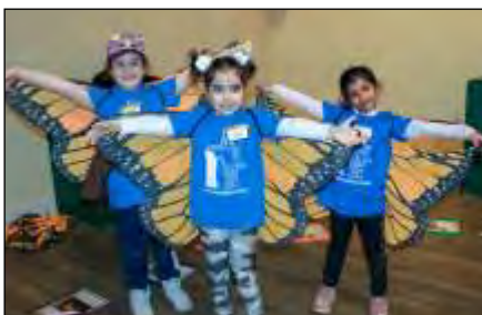
Jefferson students enjoy their day at the zoo learning about butterflies.

WCS continues to enjoy an educational partnership with the Detroit Zoo. During the months of April and May, each elementary school first grade visited the zoo to learn, observe, and explore during the Day at the Zoo Education Program.