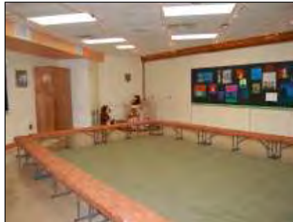
Students and staff helped design the Grizzly Den by painting the portraits on the walls, creating the bench covers and outdoor decorations throughout the room.

The school created the Grizzly Den with the recently donated funds, an area for students and staff to host meetings, events, workshops, plus much more.