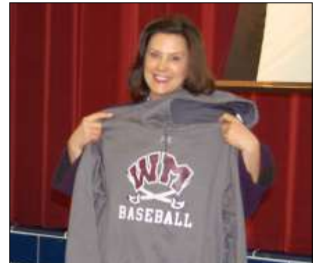
Governor Whitmer was presented with a Warren Mott Baseball sweatshirt.

Michigan Governor Gretchen Whitmer hosted a Town Hall meeting at Warren Mott High School on June 3. During her presentation, the Governor discussed roads, schools, and her proposed 2020 budget.