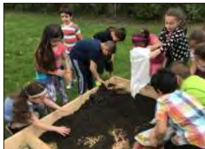
Students work on a raised garden as part of the Green Schools initiative. Beer Middle School has participated in the program for the past 11 years.

Each year the best of each category is recognized by the Board of Commissioners. Wilkerson Elementary was awarded the Top Overall school.