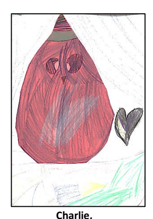
Willow Woods Elementary School